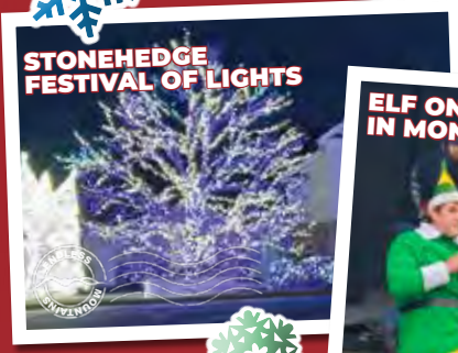
STONEHEDGE FESTIVAL OF LIGHTS