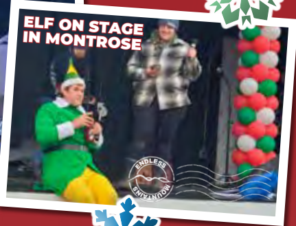
ELF ON STAGE IN MONTROSE